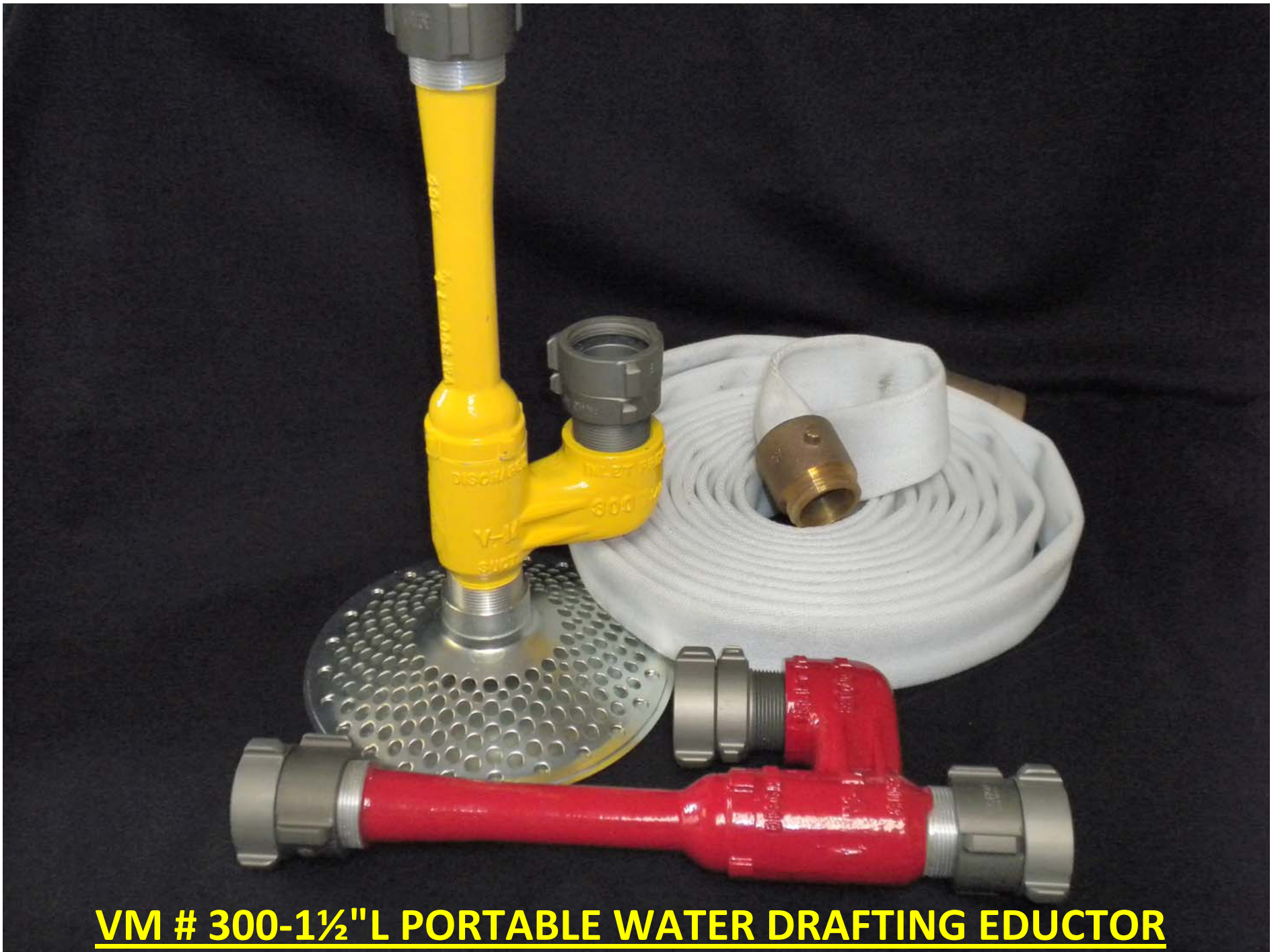
VM # 300-1½" L PORTABLE WATER DRAFTING EDUCTOR