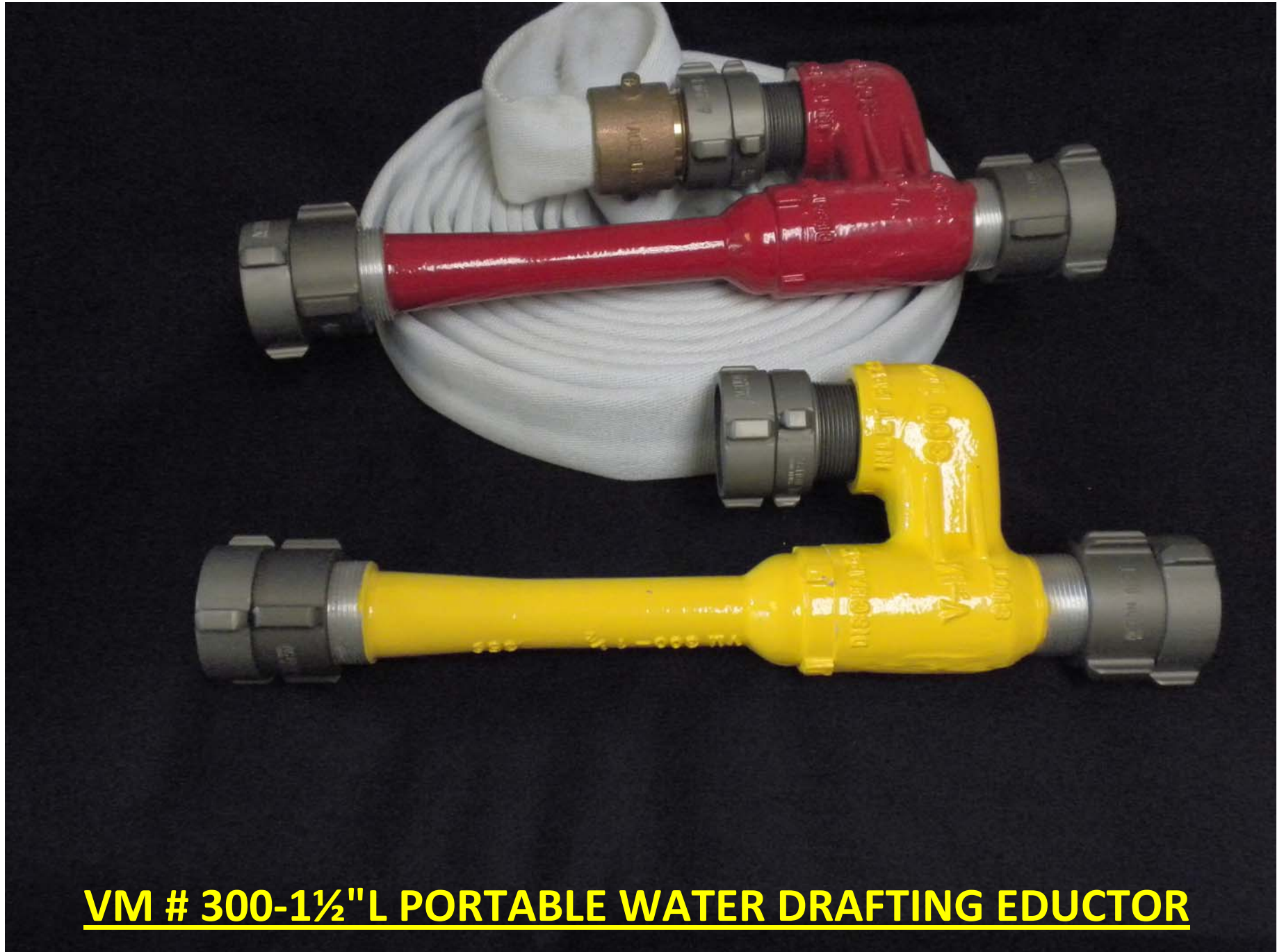
VM # 300-1½" L PORTABLE WATER DRAFTING EDUCATOR